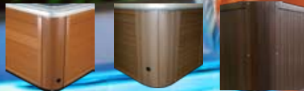
Red Country Taupe Java